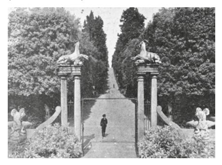
Fig. 44 - Boboli Gardens, The Avenue (period photo)