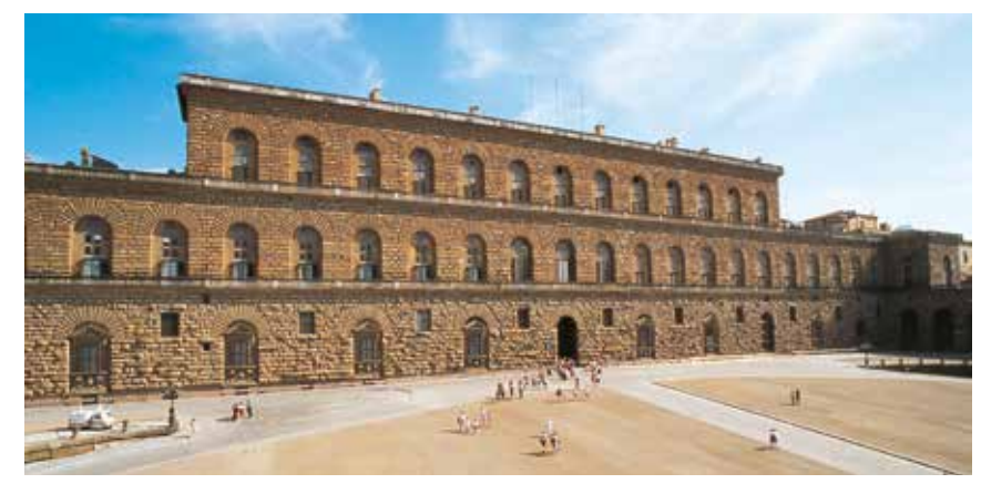
Fig. 2 - Pitti Palace, the façade

They needed a great deal of space because, besides the Medici family itself, officials, councillors, and courtiers all lived here as did the footmen, maids and housekeepers who ran the household and took care of the family's daily needs. This large group