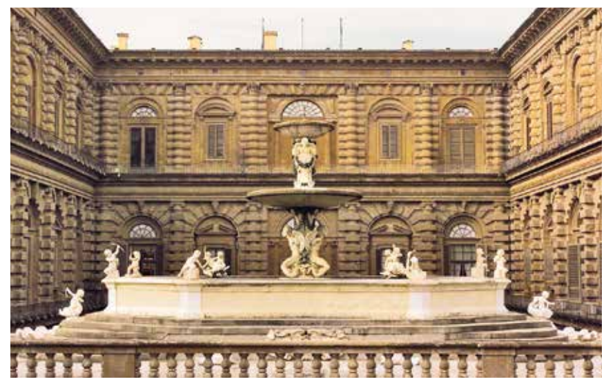
Fig. 3 - Pitti Palace, the "Ammannati Courtyard" with the Artichoke Fountain

Enlarging a palace like this one required a huge amount of hard physical work on the part of both men and animals. One little mule the builders used to pull the carts containing the stones used in construction worked so hard that she died of fatigue. To commemorate her dedication and sacrifice the Medici ordered a bas-relief – that you can see in the courtyard – to be carved in her honour.