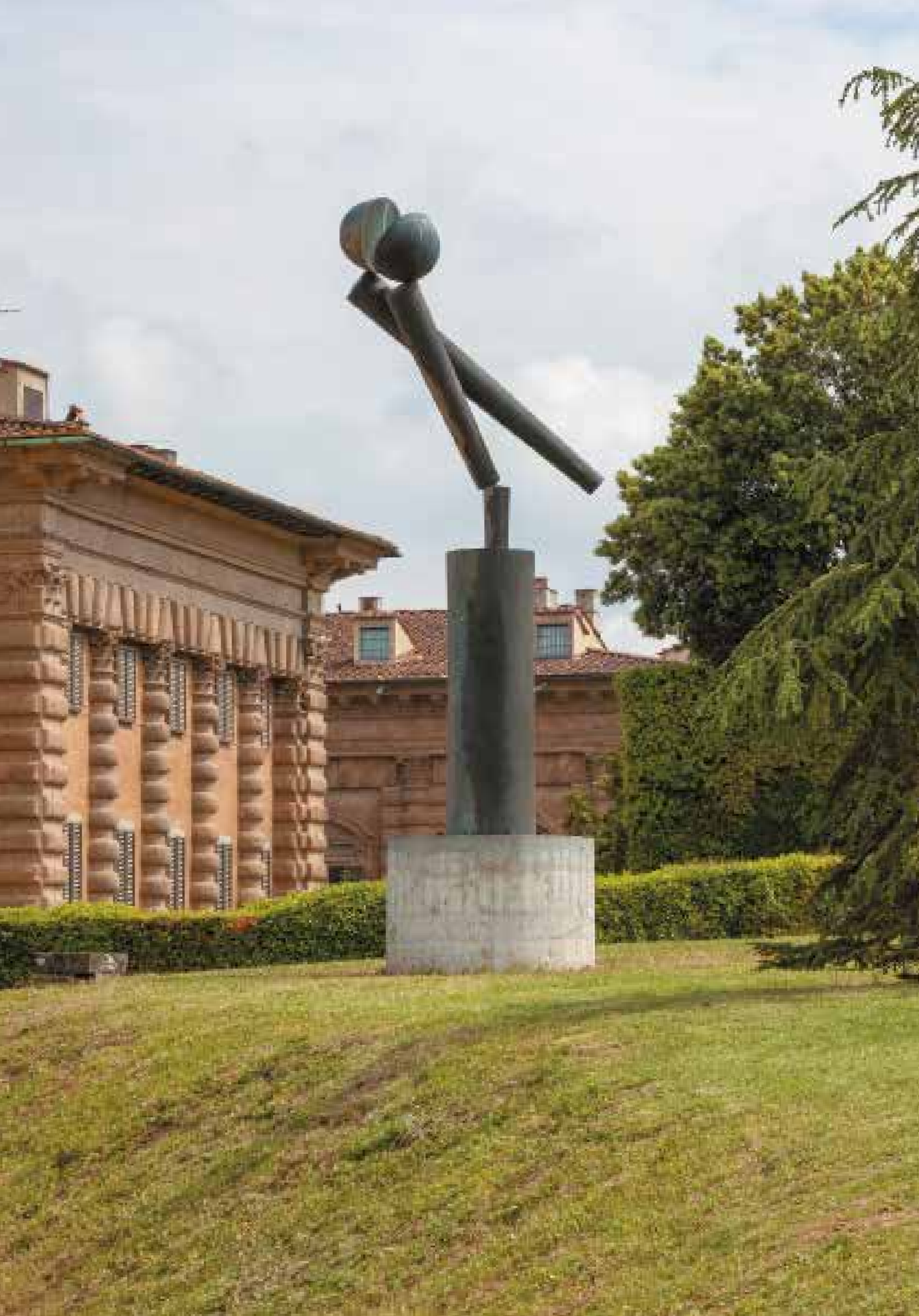
Große Zwei IX Large Two IX 1975 (50) Große Zwei XVIII Large Two XVIII 1976 (51)