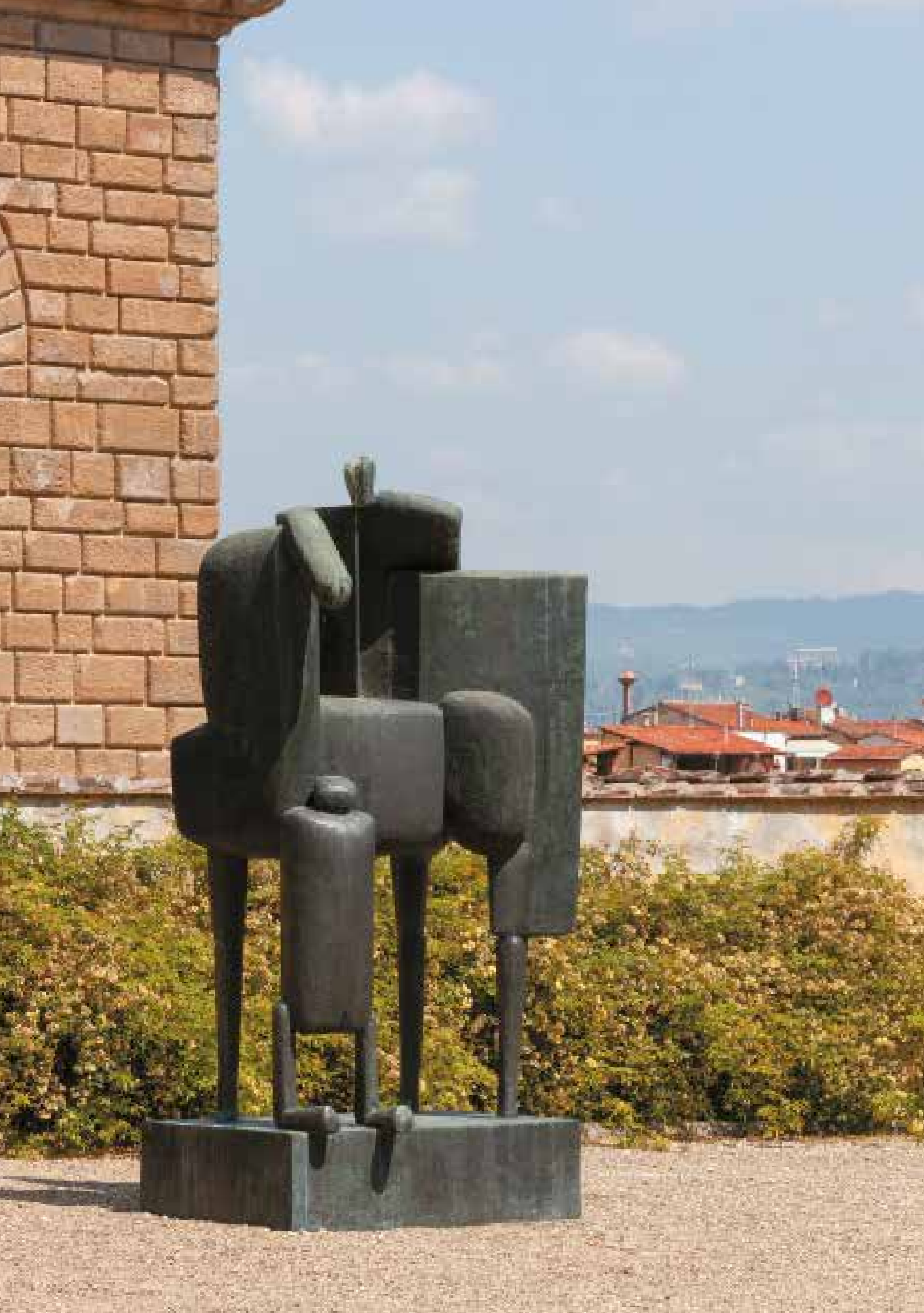
Großer St. Martin Large St. Martin 1963/1964 (24)